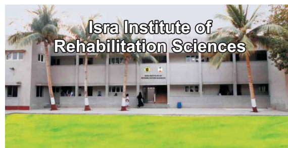
Isra Institute of Rehabilitation Sciences