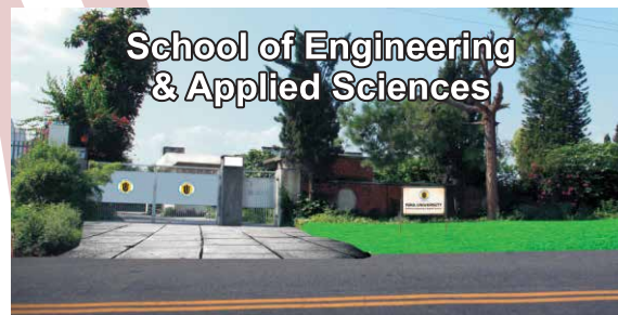
School of Engineering & Applied Sciences