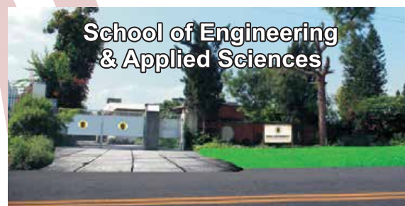
School of Engineering & Applied Sciences