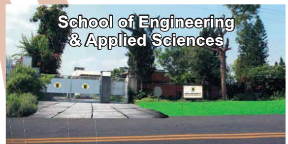
School of Engineering & Applied Sciences