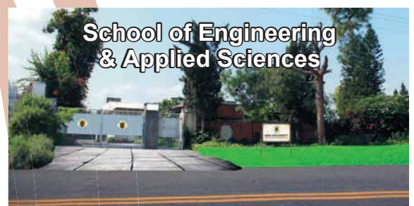
School of Engineering & Applied Sciences