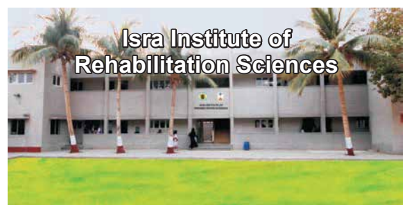
Isra Institute of Rehabilitation Sciences