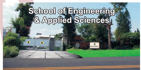
School of Engineering & Applied Sciences