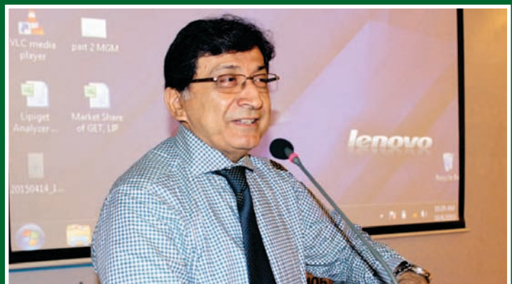
CME Workshop on Chest Pain