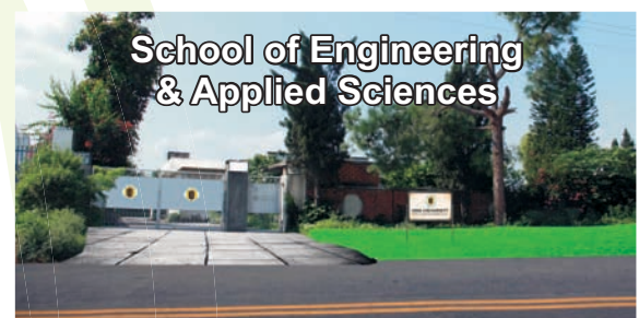
School of Engineering & Applied Sciences