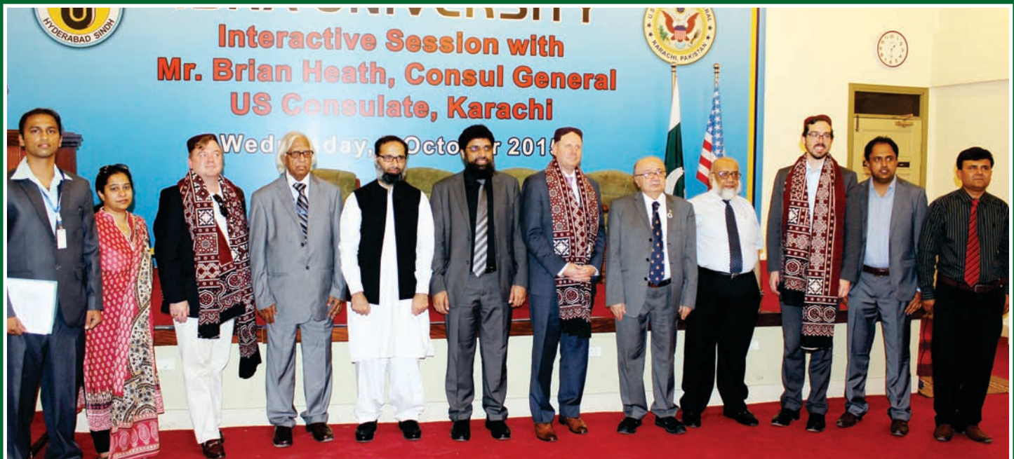
US Consul General Visits Isra University, Hyderabad