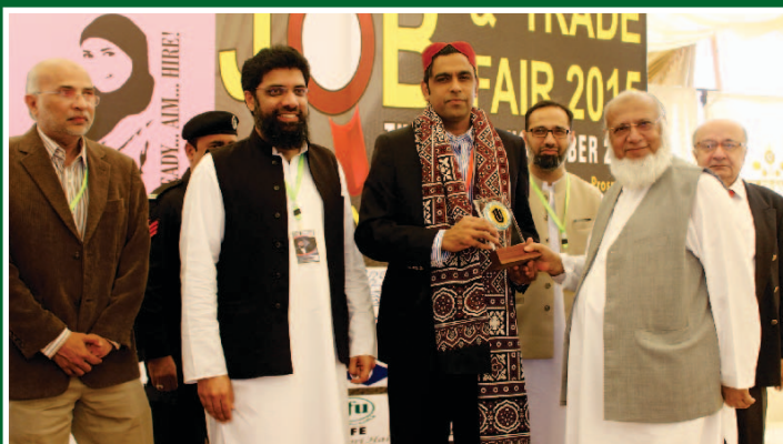
Isra Job & Trade Fair 2015: Where Job Providers Met Job Seekers