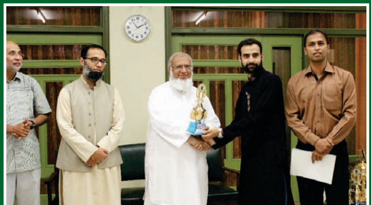
Sports Gala 2015