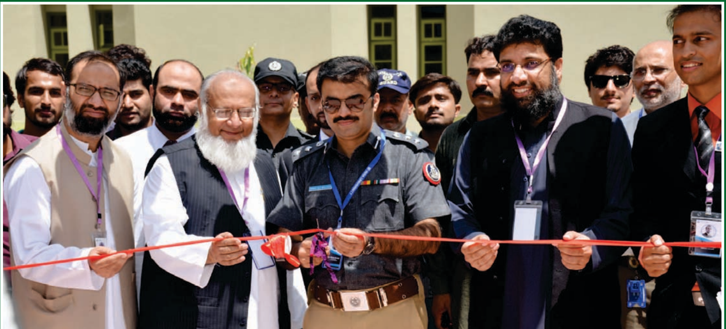
IEEE iCube 2015