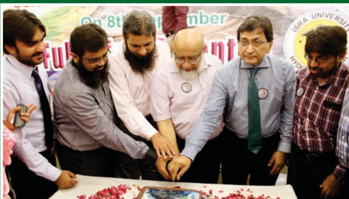
IIRS Celebrates World Physical Therapy Day