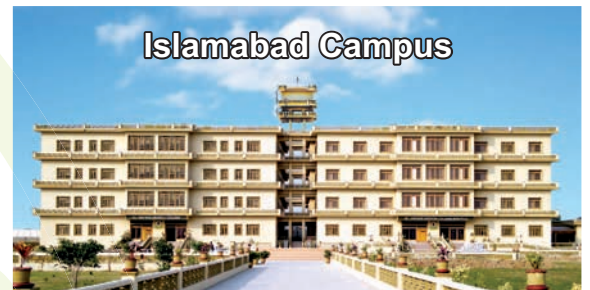
School of Engineering & Applied Sciences