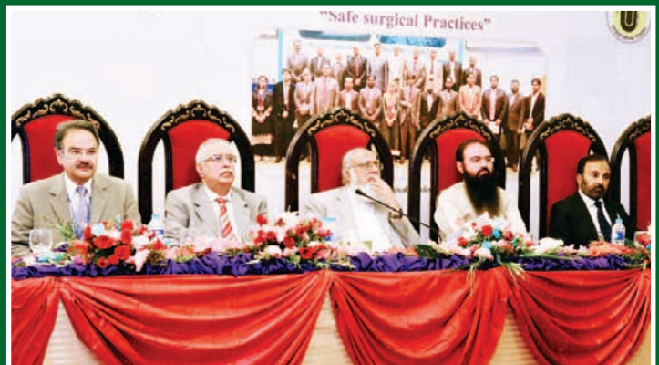
International Surgical Conference 2015