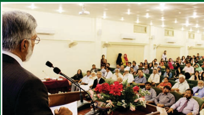
Biennial International Conference of Pakistan Physiological Society