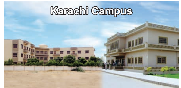
Isra Institute of Rehabilitation Sciences