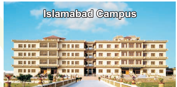
School of Engineering & Applied Sciences