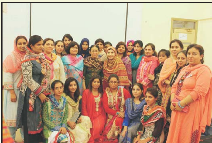
05 One Day Seminar on "Prevention of Latrogenic Fistula"