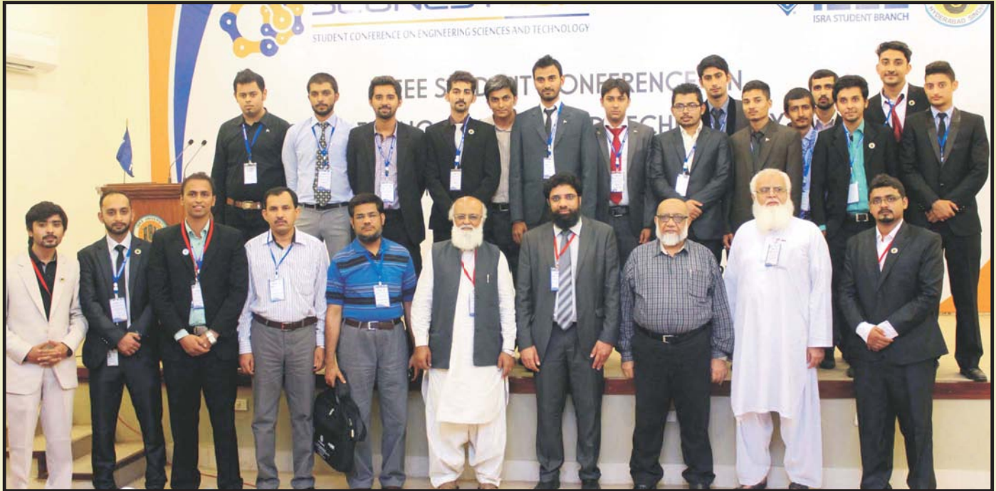
03 IEEE Student Conference on Engineering, Science & Technology (SCONEST) 2014