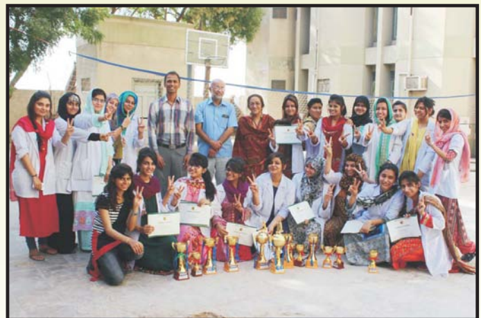
08 Sports Gala 2014