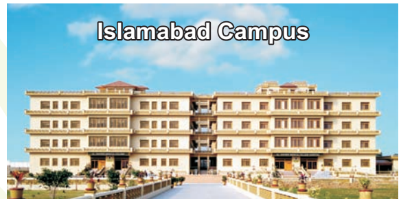
School of Engineering & Applied Sciences