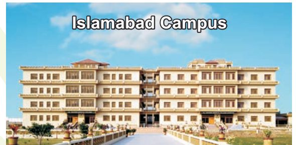
School of Engineering & Applied Sciences