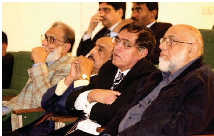
TABLE TENNIS CHAMPIONSHIP