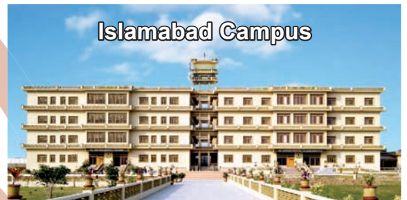
School of Engineering & Applied Sciences