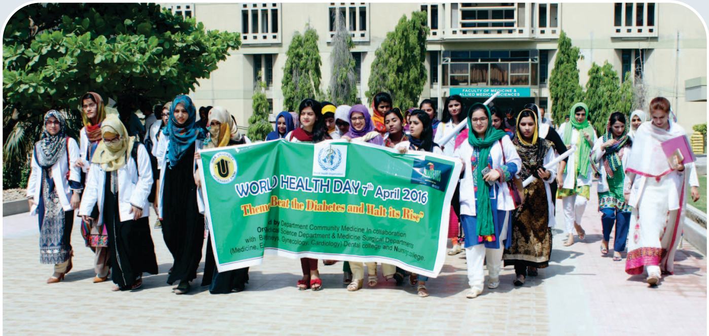
World Health Day 2016