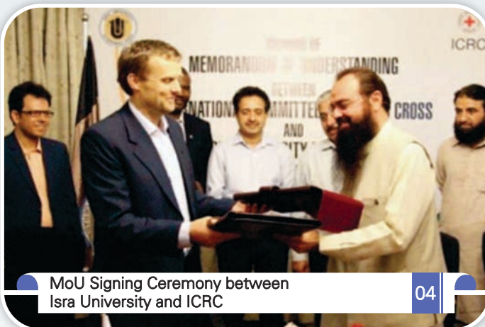
MoU Signing Ceremony between Isra University and ICRC