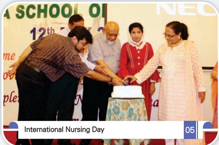
International Nursing Day