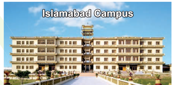
School of Engineering & Applied Sciences