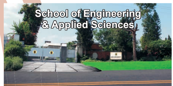
School of Engineering & Applied Sciences