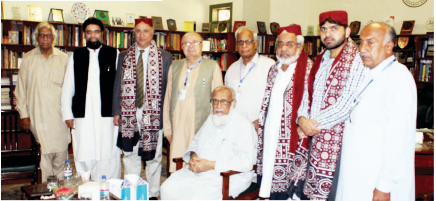
Pakistan Engineering Council Visited Mechanical Engineering Department at Isra University, Hyderabad. PEC conducted the